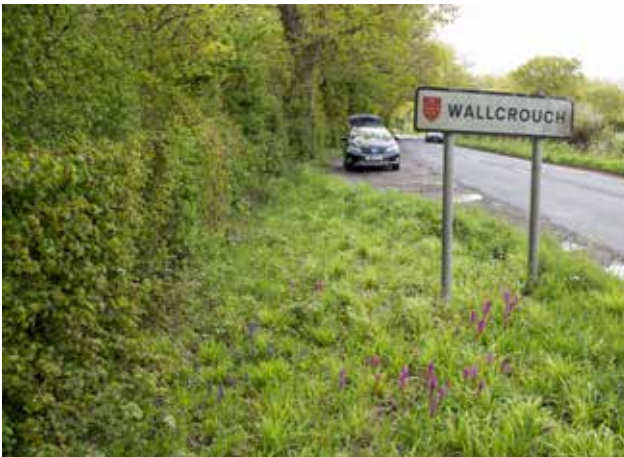
Early purples 2015