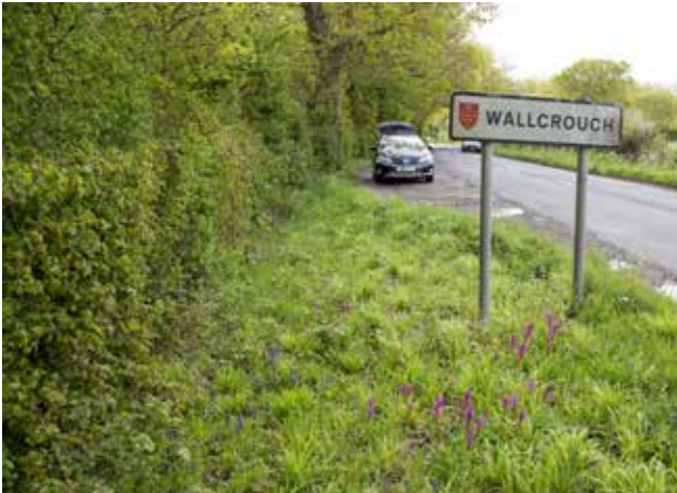
Early purples 2015