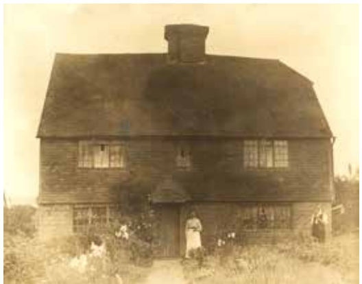
Ebenezer and Harriett Pattenden in Wallcrouch