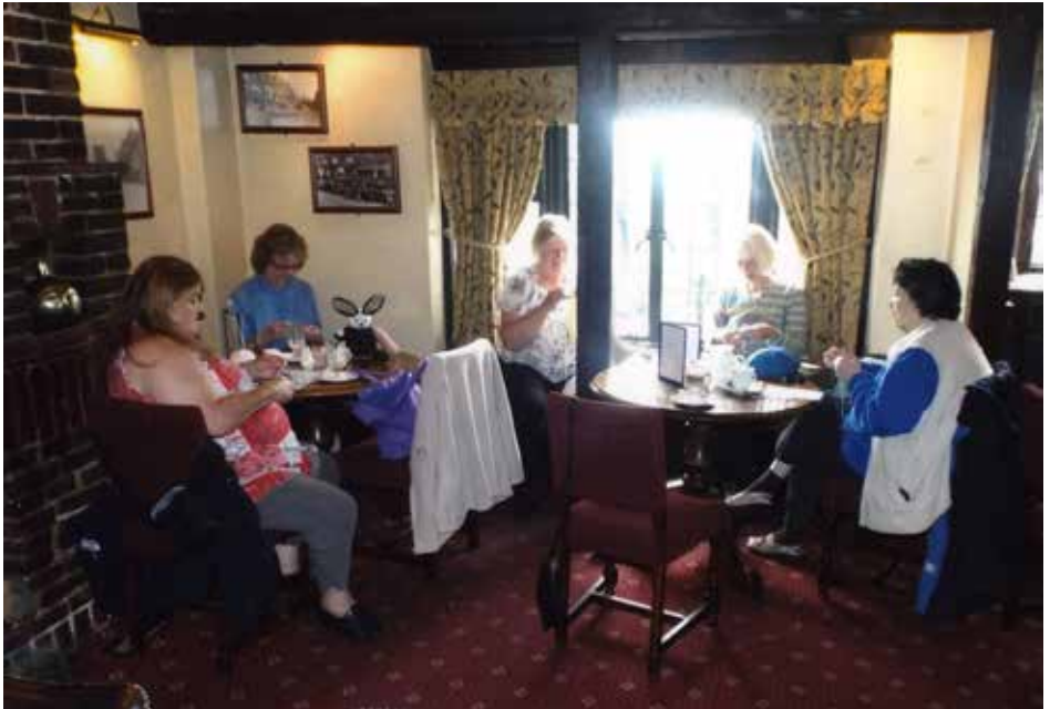
Ladies of the Knitting Group hard at work in The Star & Eagle