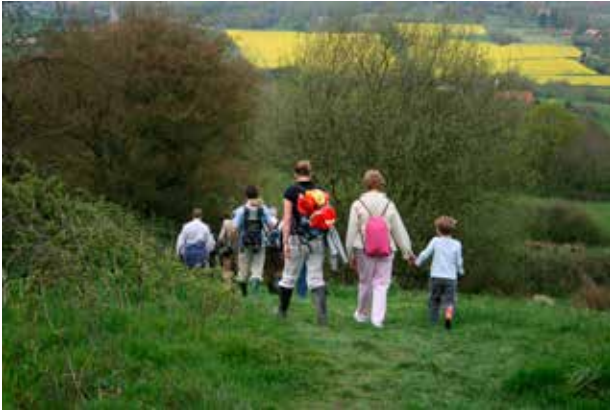
Rogation walk - 2008

On Sunday, 3 May we will be walking from Christ Church to St. Mary's. We will meet at Christ Church at 9.15 for a very short service before walking to St. Mary's in time for the Family Service at 10.45 – hopefully we should make it time and the sun will shine! Please do join us for what should be a beautiful walk. We have a full programme of activities during the summer months for everyone to get involved in – please see the website for more details.